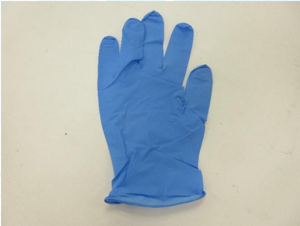
Samples described as 697024575 Disposable Nitrile Non-Sterile Glove