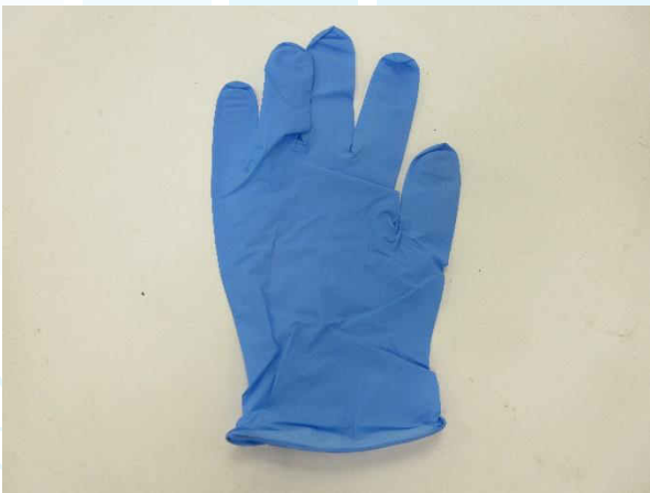
Samples described as 697024575 Disposable Nitrile Non-Sterile Glove